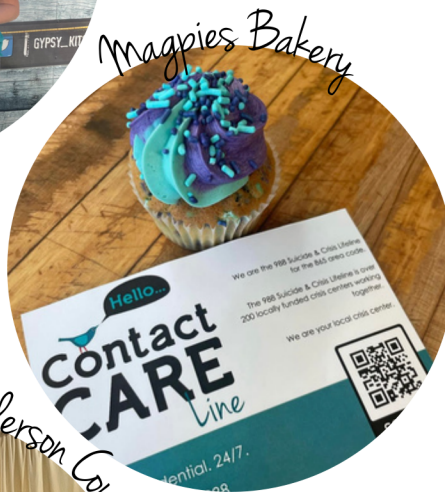
The United Way of Anderson County