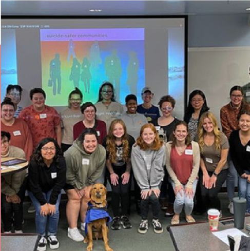
UTK Psychology 399 class upon completion of their Applied Suicide Intervention Skills Training (ASIST) course.