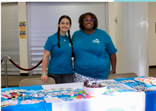
Staff and volunteers represented CONTACT Care Line at the first annual Youth & Young Adult Suicide Prevention Summit.